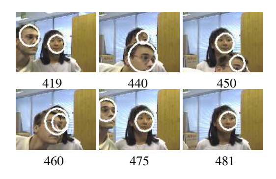
Fig. 4 . MHT with hard occlusion. The video is from [10].

We have demonstrated our system on different video sequences. In Fig. 2, we show that our approach is able to handle zooming, head pose change, lighting change, and full rotation. It works well for different poses and full rotation because we exploit motion information and update the color histogram model in the likelihood. In Fig. 3 we show the results of applying the standard Condensation filter [8] (1st row) and our approach (2nd row) respectively to the same sequence with fast motion. It can be seen that Condensation filter is not able to follow the head in time when the person moves rapidly. And the tracker can not recover the desired head again when the strong clutters distract the ellipse away. However, by using detection and motion estimation, our approach can follow the head in fast motion. Even when the ellipse deviates from the object, the detector can guide the tracker to capture it again. In Fig. 4, we show