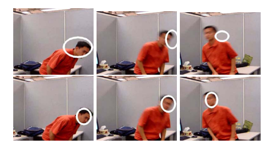
Fig. 3 . Comparison of Condensation filter with our approach to fast motion. The first row is using Condensation filter. The second row is using our approach.